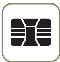
IC Card Reader